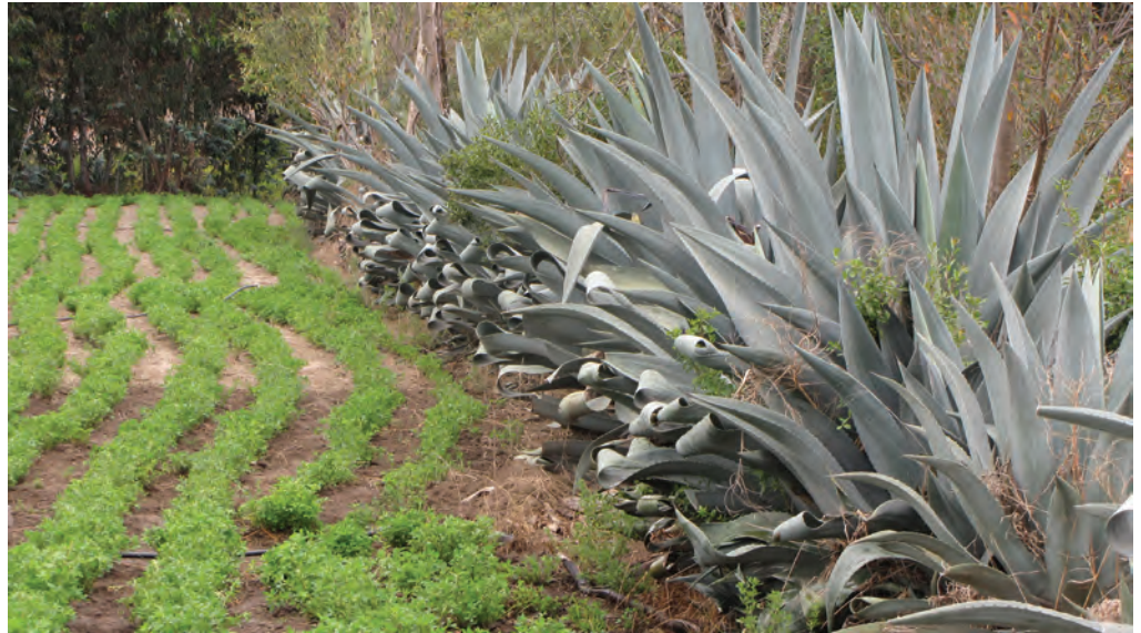
Figure 4. Live fence of Agave americana delimiting crop lands in Salasaka (Central Andes of Ecuador).

This use was also reported for F. andina . While not related to the traditional caper, Capparis spinosa , used in Mediterranean cuisine, the Agaveae caper has a similar appearance and flavor after it is pickled in vinegar, lemon or chicha . Capers are a traditional specialty during Carnival in the city of Guaranda, and thus included in the Social use category as well.