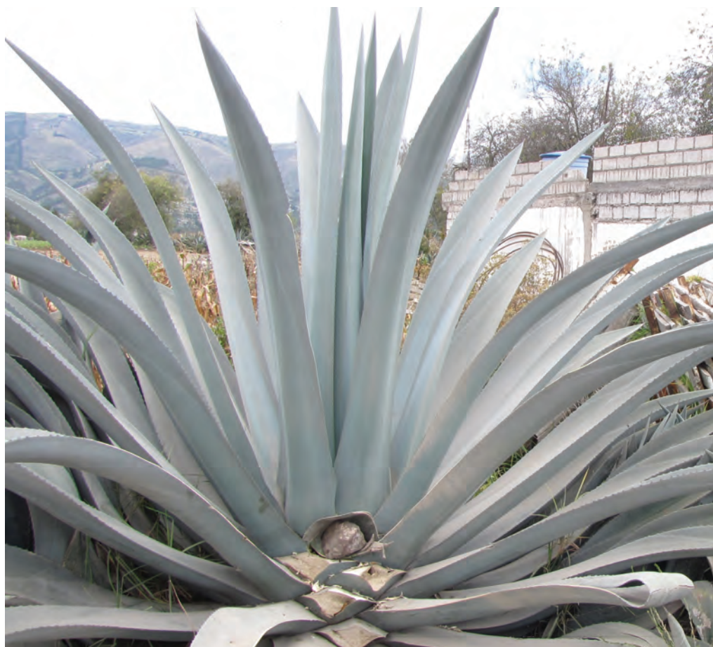
Table 5. Agave americana (A) and Furcraea andina (F) by-products marketed in Ecuador and number of current productive initiatives.

Figure 5. Method of “cutting” the agave's heart by a lateral incision, and a rock used to block the hole at the agave's heart. These practices are characteristic of the Ecuadorian Andes.