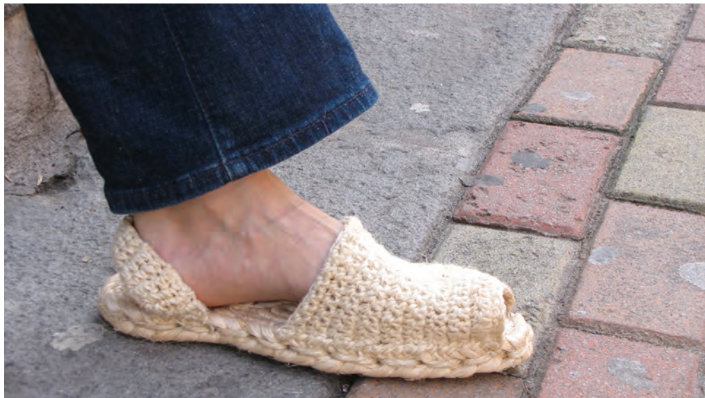
Figure 3. Espadrilles made with the fiber of Furcraea andina .

to make handicrafts and tie up crops such as tomato and cucumber. The fiber's use to tie up mattresses stuffed with kapok ( Ceiba pentandra ) cotton dates back more than 50 years. Likewise, the plant's use as shampoo, laundry soap, and as a treatment for scabies is only remembered but no longer used by the interviewees. Seven potential uses were recorded. These included new applications of the fiber, such as the production of paper ( e.g. , money, absorbent and artisanal paper), boards or linings, as a substitute for fiberglass, or the use of leaves to make fertilizer or a balanced feed for livestock. There is currently no initiative planning to test these potential uses in the near future.