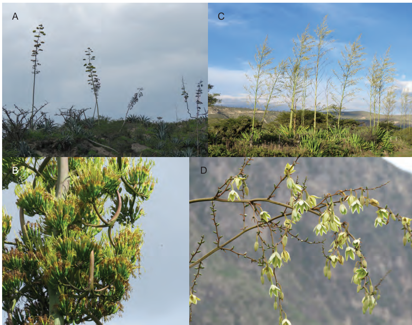
Figure 1. Agave americana and Furcraea andina in the Ecuadorian Andes. A. Flowering rosettes of Agave americana in Andean dry vegetation. B. Flowers of A. americana . C. Flowering rosettes of Furcraea andina in Andean dry vegetation. D. Flowers of F. andina .

Torre et al. 2008). This body of knowledge has been updated with the most recent publications and unpublished documents containing information on the uses of Andean Agaveae. 2. Semi-structured interviews to stakeholders of productive chains of the species studied. Interviews were conducted in June and July of 2016 across the Ecuadorian Andes (Table 1) and included a common set of open-ended ethnobotanical questions. A network of informants was created starting with representatives from governmental agencies, non-governmental organizations, and the academic sector involved in the promotion of Agaveae-based initiatives, who were asked about productive initiatives they were aware of. These informants identified centers of production and use of Agaveae in the northern, central and southern sub-regions of the Ecuadorian Andes, and constituted 19 % of the total number of interviews ( n = 37 ). Eighty one percent of interviewees were producers from these production centers. Of those interviewed, 65 % were men and 37 % were women ( n = 37 ); 57 % were indigenous people (Kichwa of the Andes), and 43 % were mestizos.